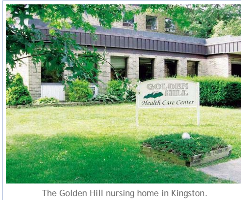
The Golden Hill nursing home in Kingston.

One major question still needs to be answered: Where did the bacteria enter the water system? It's no secret that Ulster County has been warned at least five times since 2002 that Golden Hill's pipes are corroded, weak, leaking and in danger of "catastrophic failure." Thus far, lawmakers have avoided making a decision about renovating or